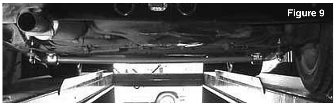
Fig.9 shows the bar installed.

Now that you have the end links tight you can tighten the bushing brackets as shown in fig.8 Check all four bolts/nuts to make sure they are tight.